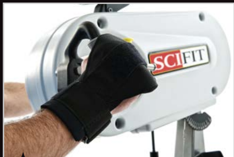
Optional Assist Gloves to help with grip.